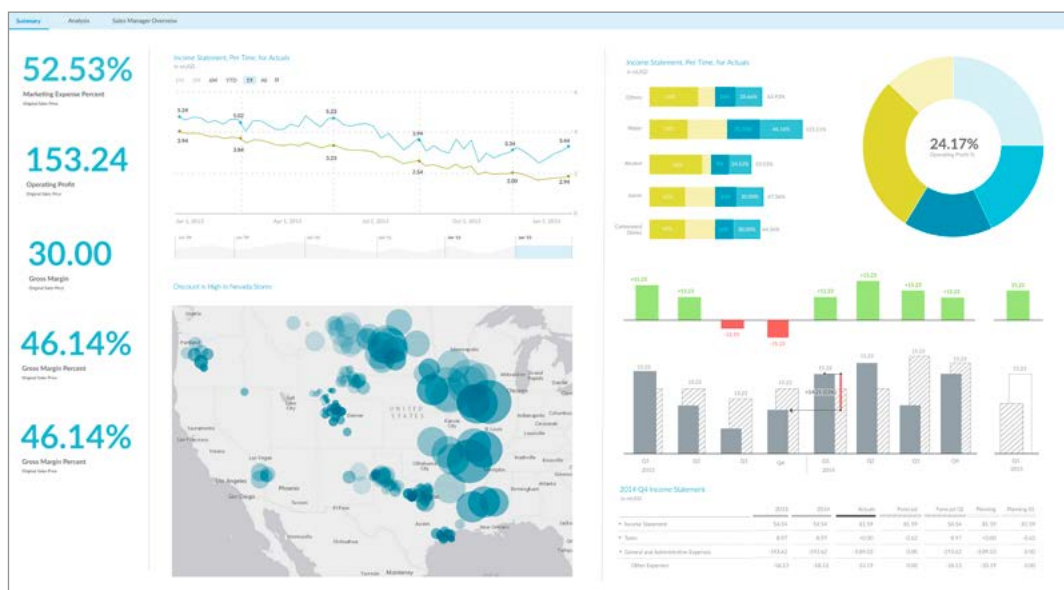
Figure 2: Examining and Improving Profitability

A Nucleus Research note of October 2015 reports the ongoing benefits of SAP Analytics Cloud: “The offering provides users with a faster time to analysis by supporting a single repository of analytics tools.”